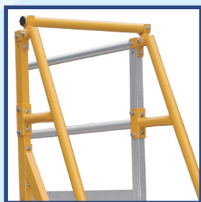
Front safety boom arm