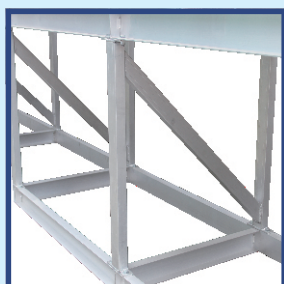
Box section and channel supports